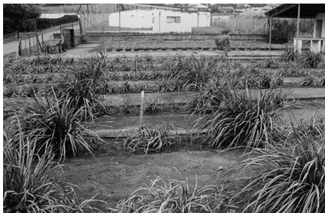
Fig. 1. Buster herbicide application to transformed sugarcane line 22.2 and untransformed parent cultivar NCo310 in a small-scale field trial. Incremental amounts ( 1\text{--}7 \text{ L ha}^{-1} ) were applied to successive rows in plant cane and two ratoon crops, so that the transgenic cane in Row 7, to which 7 \text{ L ha}^{-1} Buster was applied in the plant crop, received a total dose of 21 \text{ L ha}^{-1} of Buster. Phytotoxic symptoms were visible on untransformed cane at all the rates tested (center; far right and left) and rates >4 \text{ L ha}^{-1} were lethal. No phytotoxic damage was evident in the transformed line (flanking center).

Plants of transgenic line 22.2 showed no signs of damage after Buster application of rates as high as 7 \text{ L ha}^{-1} . Untransformed cane plants of parent cultivar NCo310 displayed phytotoxic symptoms at 1 \text{ L ha}^{-1} . Damage was extreme at 4 \text{ L ha}^{-1} and plants died after application of 5 to 7 \text{ L ha}^{-1} (Fig. 1). Buster was applied to two ratoon crops at a rate of 7 \text{ L ha}^{-1} , so that the transgenic cane in row 7, to which 7 \text{ L ha}^{-1} Buster was applied in the plant crop, received a total dose of 21 \text{ L ha}^{-1} of Buster. This repeated application of the herbicide with no phytotoxic symptoms indicates that the introduced gene is stable and expressed across successive ratoon crops. Such stability has been reported in sugarcane previously (Gallo-Meagher and Irvine, 1996). That work also was based on use of the cultivar NCo310.